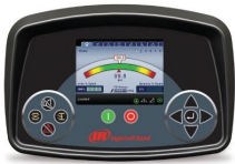
Xe-145F Series Centrifugal Compressor Controller