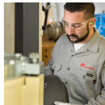
Field Overhaul Services