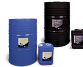
Tectrol Gold Centrifugal Compressor Lubricant