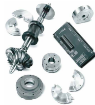
MSG® Centac® Centrifugal Compressor Replacement Parts