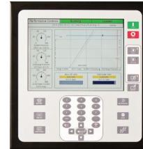
MAESTRO Universal Centrifugal Compressor Control System