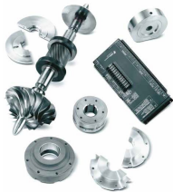
MSG® Centrifugal Compressor Replacement Parts