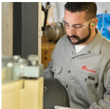
Field Overhaul Services