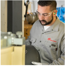
Field Overhaul Services