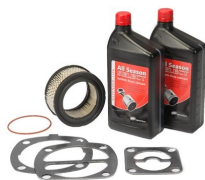
Small Reciprocating Maintenance Kits