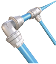
SimplAir Compressed Air Piping