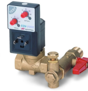
Electronic Drain Valves