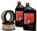
Small Reciprocating Start-Up Kits