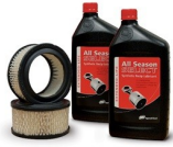
Small Reciprocating Start-Up Kits